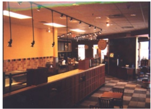
Completed and ready for business