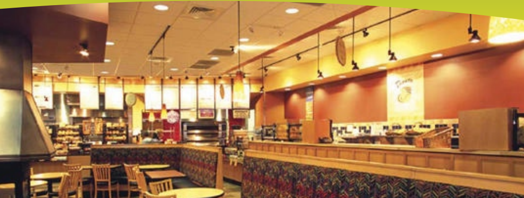
Panera Bread electrical project – completed and ready for business