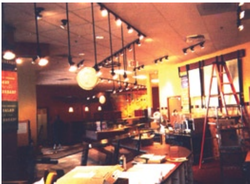
Work performed during construction of Panera Bread

"After the terrible systems in our past, it is refreshing to work with a company that has our best interest in mind. I am now able to focus on keeping our customers happy and building our business."